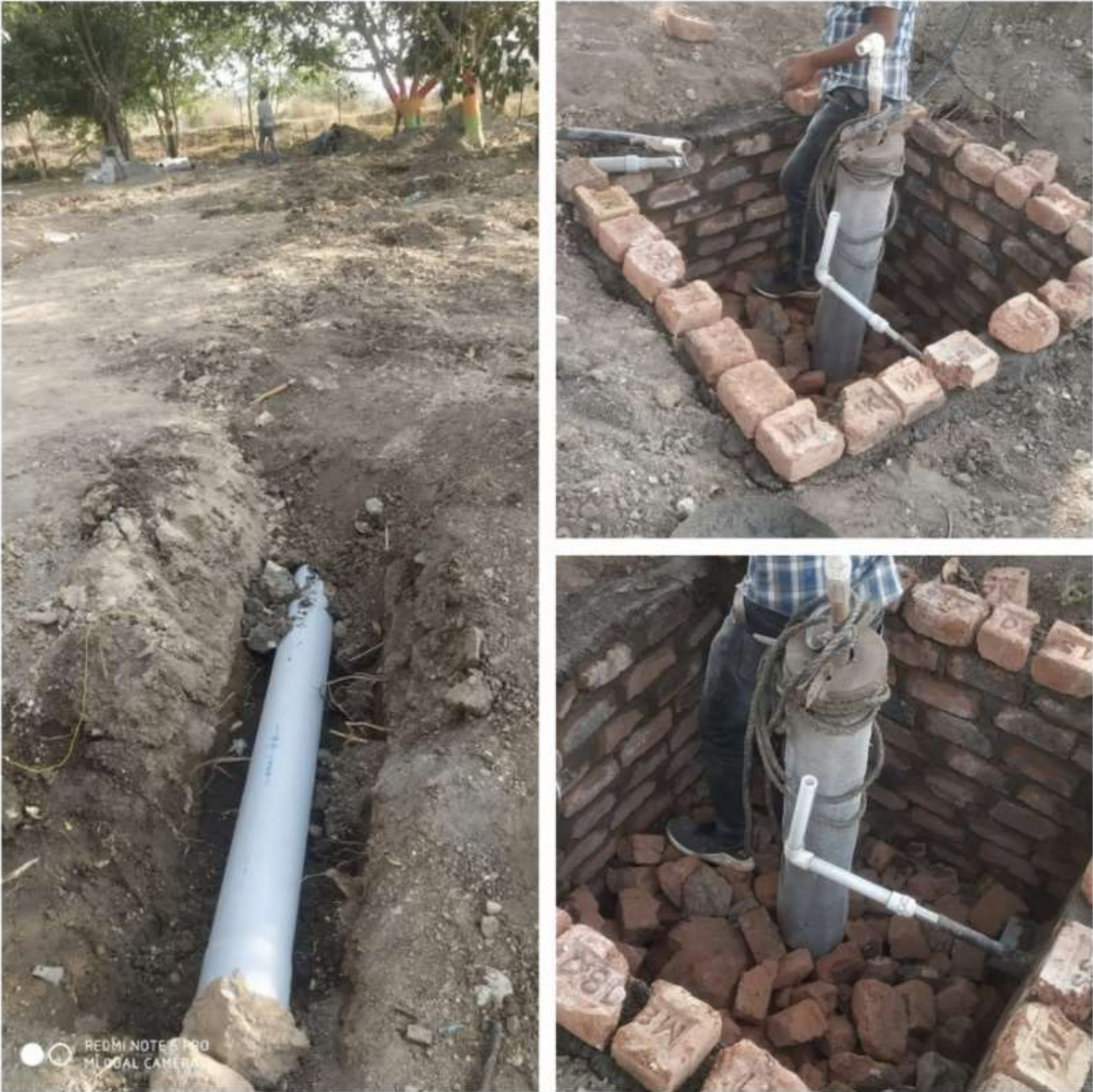
The collected rainwater is then channeled to two existing borewells with a view to recharge them