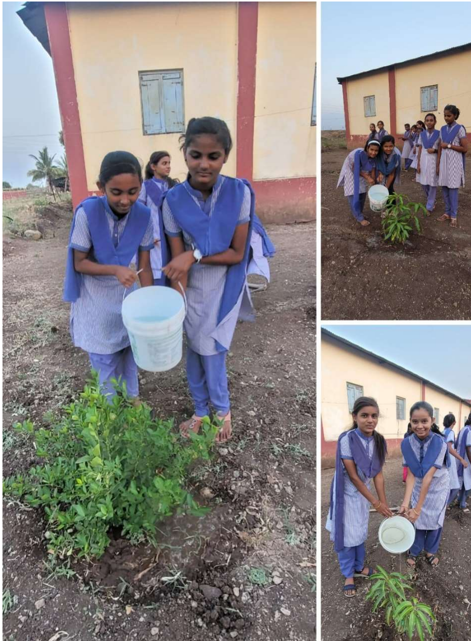
Children nurturing the trees through hot summer months (the trees were provided by LK Jha Foundation in June 23)

LK Jha Foundation also planted 300 saplings in Chikhali village last year which will grow into an orchard. The recharged borewells will help water these plants.