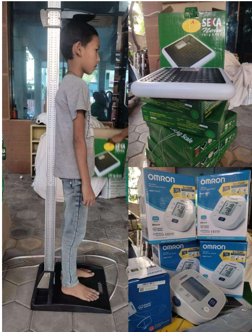
Medical apparatus presented for children of construction workers at Mobile creches

LK Jha Foundation supported the needs of children of construction workers at multiple creches run by Tara Mobile Creches across Pune by assisting them to purchase medical equipments such as BP apparatus, weighing machines, stadiometer, etc. to monitor the growth and development of the children.