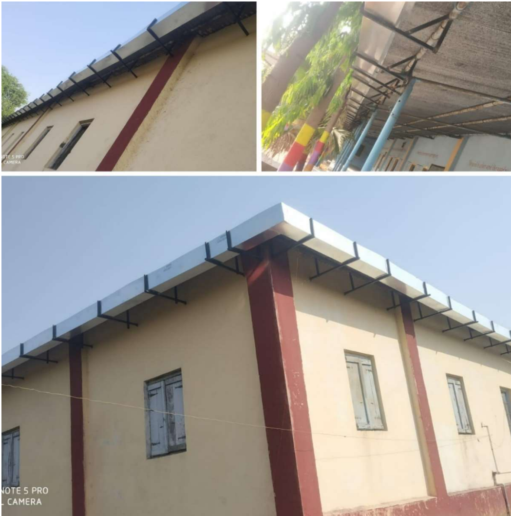
Using the school roof, LK Jha Foundation has installed metal sheet to collect the rainwater

LK Jha Foundation has completed many projects in Chikhali village earlier. Chikhali is located in Ahmednagar district and is an area with water scarcity. The village already has two borewells in the school premises. LK Jha Foundation has helped with the rainwater harvesting project using the school roof.